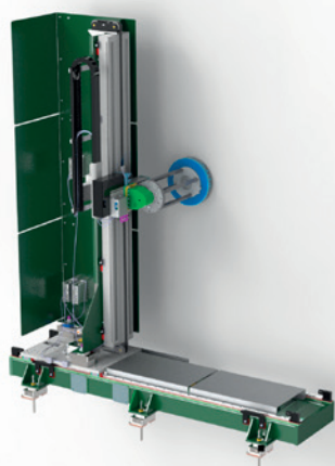
Planar Near-Field Scanner: back view