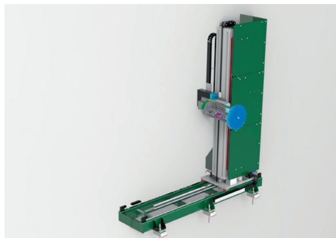
Planar Near-Field Scanner: front view